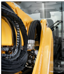
Helagaine HEGWS: The ideal protective sleeve for hydraulic hoses.